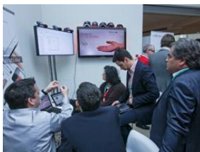
Images from Partner Village 2013